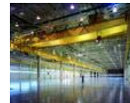
Midlink Business Park interior